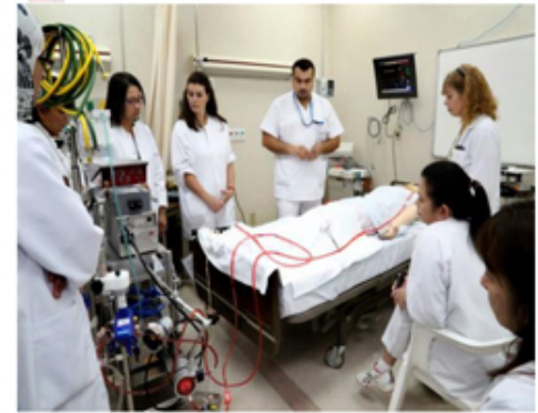
Trouble-shooting and Simulation sessions