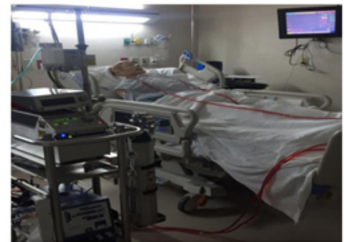
CME hours will be awarded by SCFHS